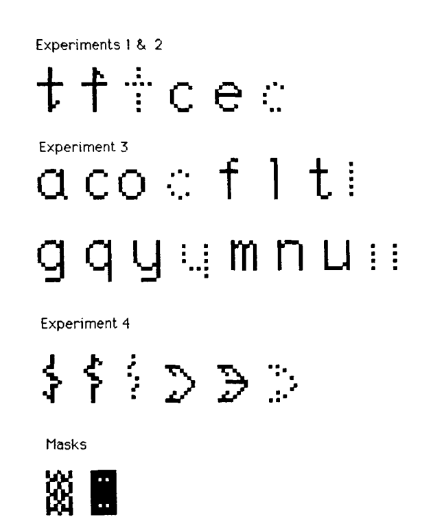
Figure 2. The targets (solid forms), primes (dotted forms), and masks (bottom row) used in each experiment.

The events on each trial were as follows: A fixation point (a "+") appeared at the center of the display area for 250 msec, followed by a blank interval of 250 msec; a priming period of 33-67 msec (depending on the experiment); a target period of approximately the same length; a masking period of 500 msec; a forced-choice display terminated by the subject's response; and either a positive ("+" for 125 msec) or a negative ("-" for 250 msec) feedback display that depended on the correctness of the response. The stimuli were centered on the same location (the letters had a common baseline). The interval between trials was 400 msec. The initial target duration varied with the experiment, and the effective duration for each subject was adjusted after each block, depending on performance during that block. Duration was adjusted upward if perfor-