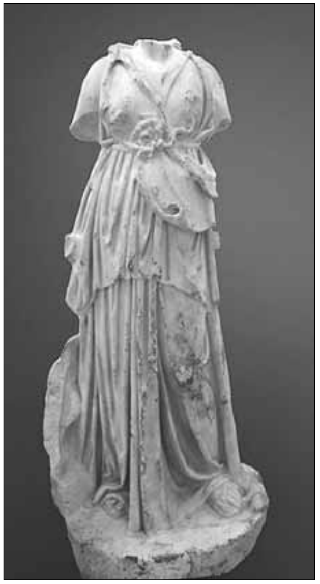
4. Athena Hephaisteia, 150-200 AD, marble, Roman Theater, Amman (exact findspot unknown).

Also from the Theater in Amman and of comparable scale to the over-life-size statue of a cuirassed emperor is an over-life-size statue of a draped female ( Fig. 2 ), which stands 1.46 m tall and preserves the torso, most of the legs, and portions of both arms of the figure (El Fakharani