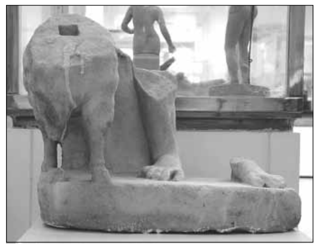
5. Base of a statue of Hermes, 150-200 AD, marble, Roman Theater, Amman (exact findspot unknown).

Asklepios of the Florence type ( Fig. 3 ) stands .76 m tall and preserves the torso from the base of the neck to just below the navel as well as the figure's left arm (Weber 2002: 505-506). The god wears a mantel that is pulled diagonally across the back, flows over the left shoulder and down the left side of the body, and crosses the front of the torso horizontally over the navel. Where the body is exposed, the musculature is modeled naturalistically. The piece has been dated stylistically to the second half of the second century AD (Antonine period) and has been identified as a replica of the cult statue of the Pergamene Asklepieion (Weber 2002: 505-506).