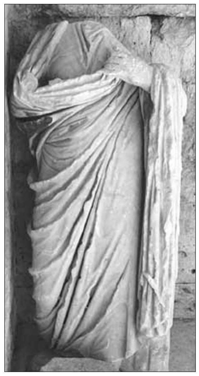
2. Draped female, late Hadrianic/early Antonine period (125-175 AD), marble, Roman Theater, Amman (exact findspot unknown).

The over-life-size statue of a cuirassed emperor ( Fig. 1 ) stands 1.18 m tall, preserving the torso and upper legs of one of the Antonine emperors (El Fakharani 1975: 399-400; Stemmer 1978: 25, II 4a; Vermeule 1978: 104-105; Weber 2002: 509-510; Gergel 2004: 400). Though there is not enough evidence to determine whether the statue represented Hadrian or Antoninus Pius, the composition of the breastplate and the motifs on the lappets are best associated