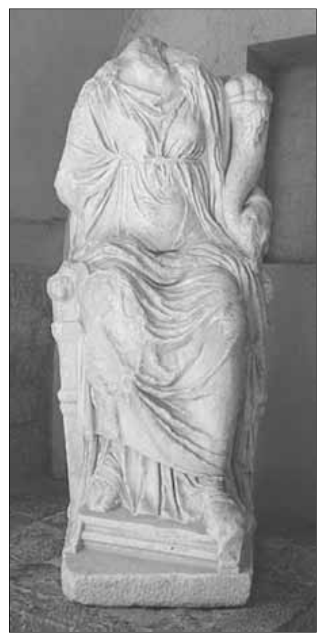
8. Seated Tyche, 125-150 AD, marble, Orchestra of the West Theater, Gadara/Umm Qays.

wide, and .31m deep. The piece may be dated to the late Flavian or early Trajanic period (last quarter of the first century AD), based on the nature and arrangement of its toga, from which the sinus and umbo are still well-preserved.