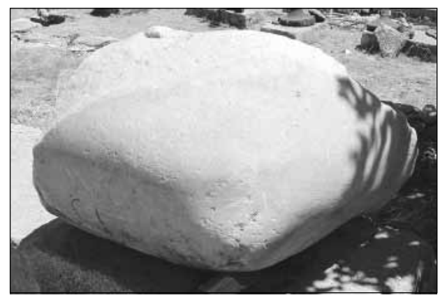
7. Colossal elbow, 3rd century AD?, marble, immediate area of the Great Temple, Amman.

rial; alternately, it could be evidence of repairs in antiquity. The exact identity of the original piece remains unclear; some scholars have argued that the veins indicate that the piece depicted a male deity, while others argue that the slender, elongated nature of the fingers suggest a