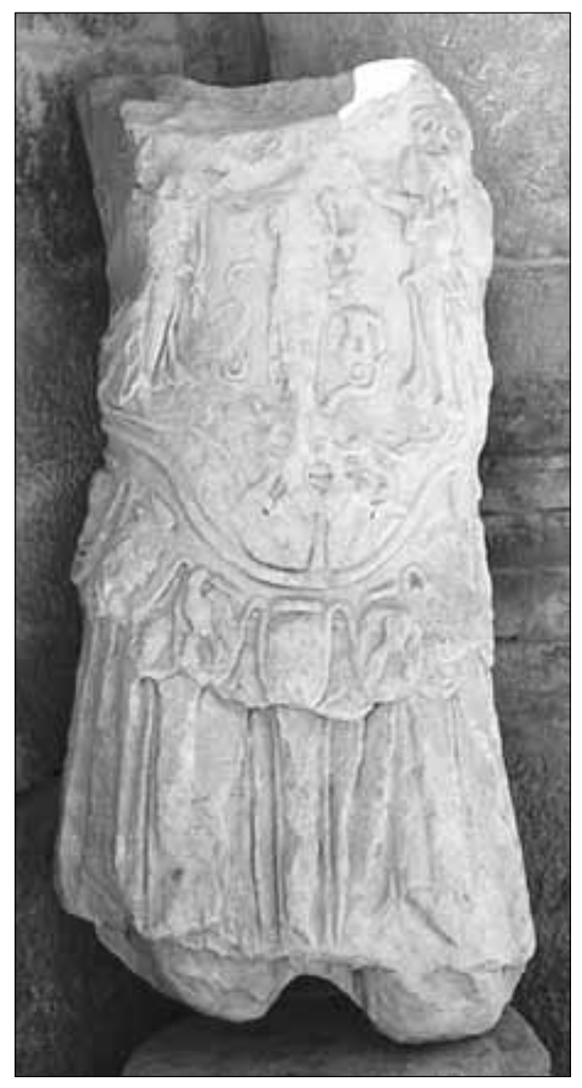
1. Cuirassed Roman Emperor, late Hadrianic/early Trajanic period (125-150 AD), marble, Roman Theater, Amman (exact findspot unknown).

2004: 400). This inscription associates the date of renovation and decoration of the stage building with Antoninus Pius, though it does not provide a secure date for the construction of the theater itself or for the individual statues discovered within its ruins. Five statues were uncovered in the excavations of the theater (though their exact findspots are unknown): the torso and upper legs of a larger-than-life-size cuirassed Roman emperor ( Fig. 1 ); the body of a larger-than-life-size draped female ( Fig. 2 ); a larger-than-life-size torso of an Asklepios of the Florence Type ( Fig. 3 ); the body of a miniature Athena Hephaisteia