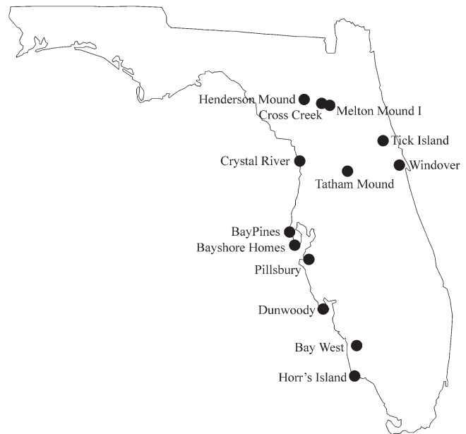
FIGURE 18-1 Map indicating location of coastal, estuarine, and inland sites tested in this study, plus other sites in peninsular Florida.

Skeletal material was analyzed from the inland site of Cross Creek (8A12) Alachua County. The Cross Creek I mound was excavated by the University of Florida in 1964.